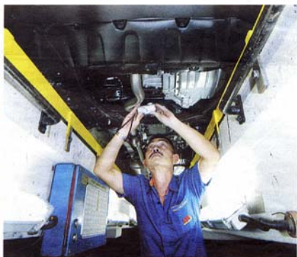
The Vehicle Inspection and Type Approval System is a computerised solution that replaces LTA's old manual method.

manual system. With Vitas, hard copy applications for vehicle approval is eliminated or reduced. Which means better customer service and efficiency for the VED operations.