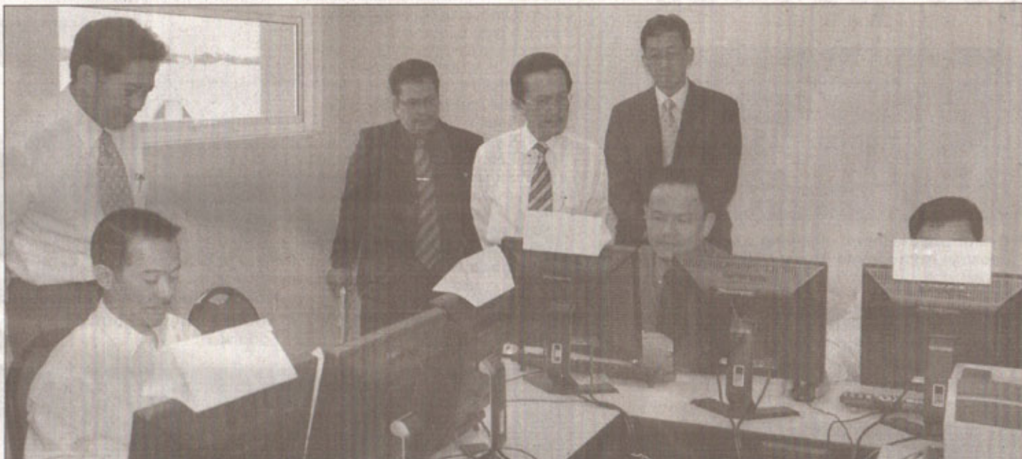
Minister of Communications taking a closer look at a training session